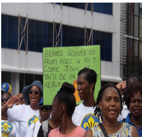
Parents and Friends of Scouting participating in the March