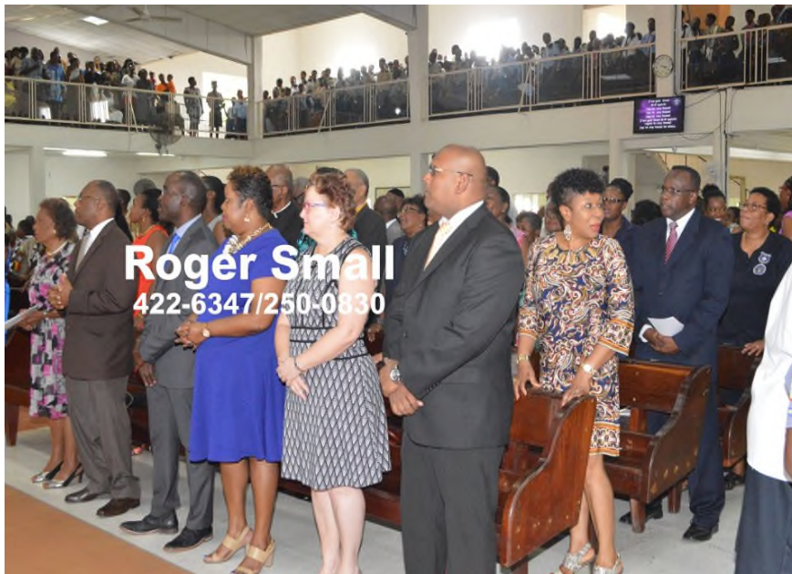
Part of the congregation enjoying themselves with the Scouts at the Church Service