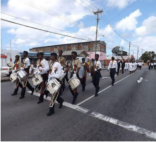
The Band is always instrumental in leading the BBSA detachment en route