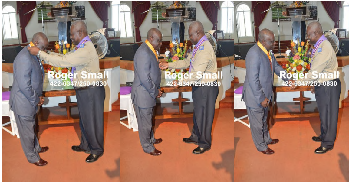
The President of the BBSA receiving the Award – The Silver Coconut from the Chief Commissioner at the Founder's Day Service