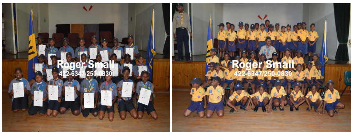
Beaver & Cub Scouts pose with after receiving their awards

These awards are the culmination of dedicated work, the completion of proficiency badges, personal and many challenges, as well as other activities so assigned.