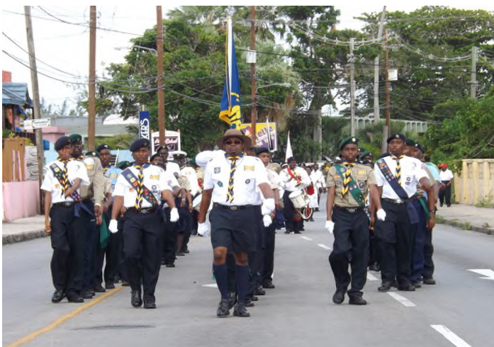
Scouts on the March

As is the national custom the members of the Barbados Boy Scouts Association were out in their numbers for the Independence Parade.