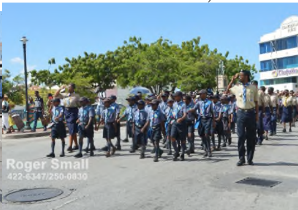
One of the detachment on parade