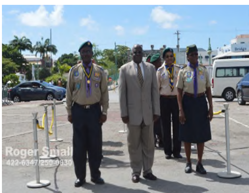
Awaiting the parade

Pictures from Promotional March Held on October 31, 2015