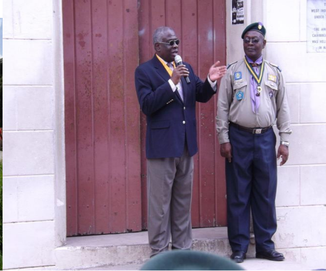
Chief Scout & Chief Commissioner