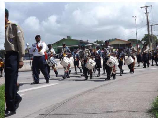
One of the bands on parade