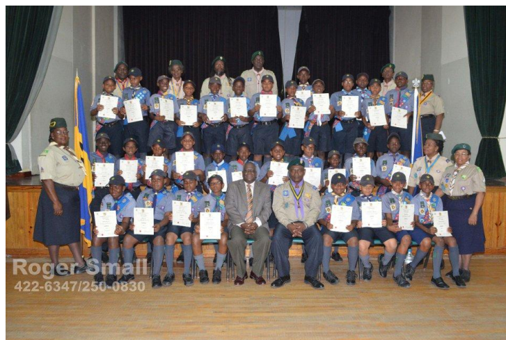
Beaver & Cub Scouts pose with after receiving their awards (File copy)

These awards are the culmination of dedicated work, the completion of proficiency badges, personal and many challenges, as well as other activities so assigned.