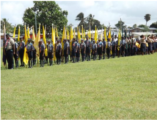
Getting ready to 'Step off'