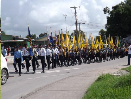
On the move