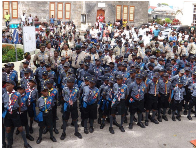
Before the dismissal