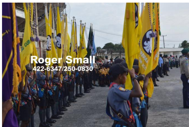
Forming up the parade to step off to the GYM