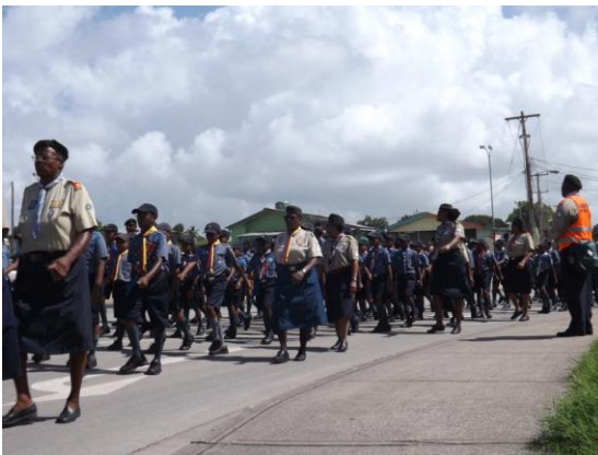
Cub Scouts and Leaders