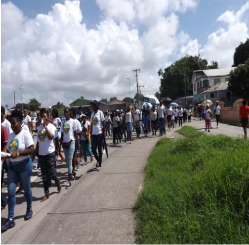
Parents are always involved