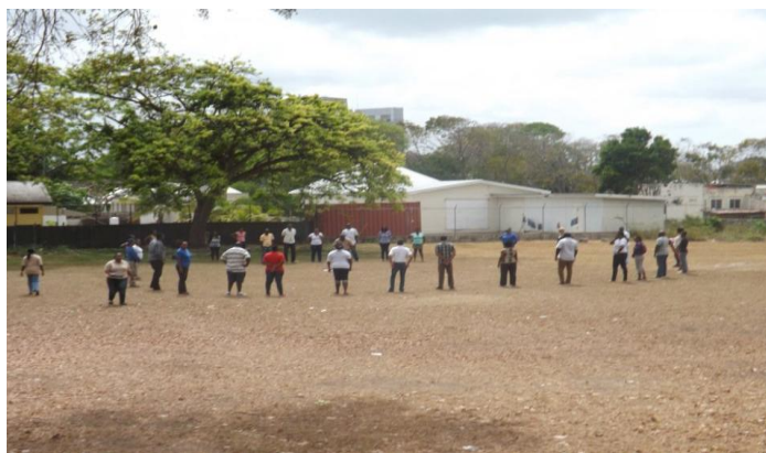
New Leaders in training