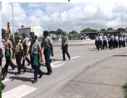
Scouts on the March