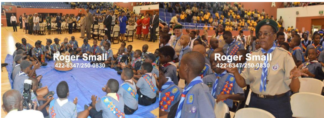
Scouts enjoying themselves singing camp fire songs with their portable camp fire at Founder's Day