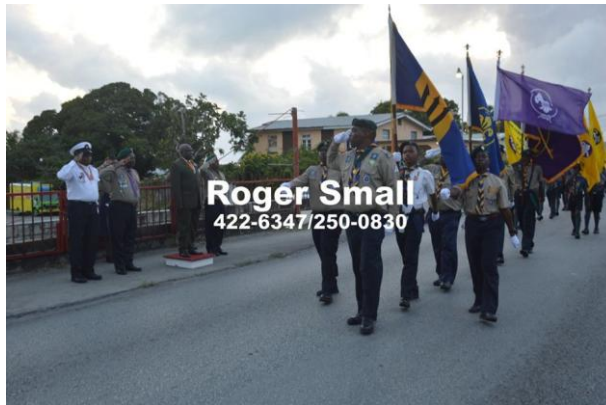
The Chief Scout taking the Salute by the Cenotaph in Bridgetown. (File copy)