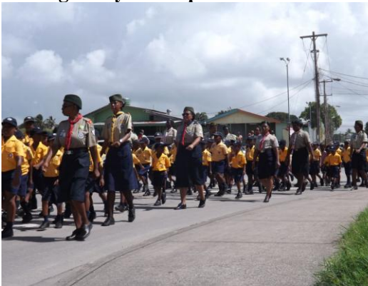
Beavers marched too